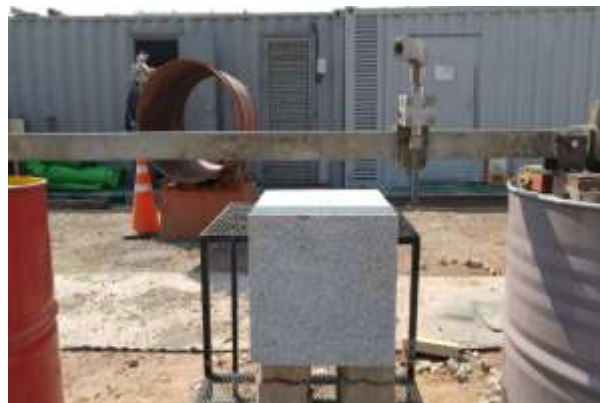
Fig. 1. Components of the AWJ system.

A waterjet using a single nozzle system was implemented by high water pressure with certain water flow rates and traverse speed. For this test we used a diesel plunger pump that generates a high water flow rate. The pump's power was 600 HP and the maximum water flow rate was approximately 80 l/min at 250 MPa. For the orifice and focusing nozzle parts, a sapphire orifice (inner diameters of 0.89 mm) was utilized in this test; the water flow rate reached 18.78 l/min/ea at 250 MPa, and the focusing nozzle inner diameter was 2.29 mm. Waterjet nozzle traverse system can be operated at the same standoff distance conditions (10 mm for a single nozzle system) for a given traverse speed. Water pipes supplied the high pressurized water and abrasive pipes entrained the abrasives inside the nozzle mixing chamber using induced suction pressures (e.g., abrasive injection type).