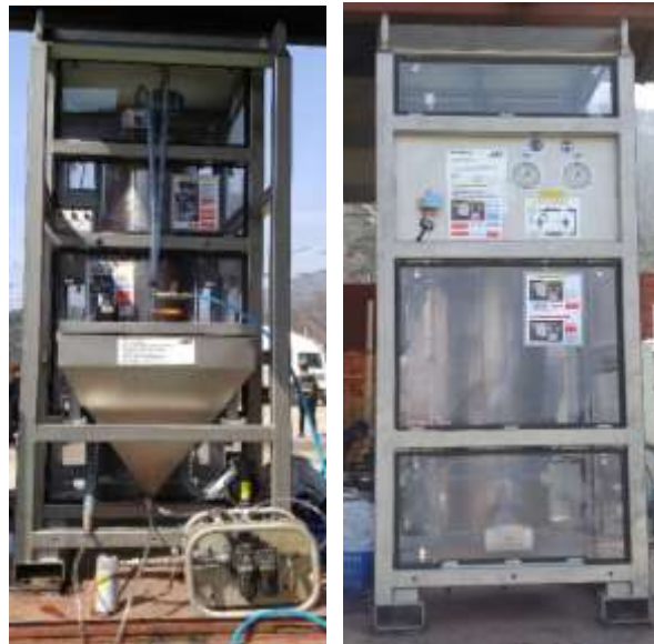
(b) Abrasive Mixing Unit