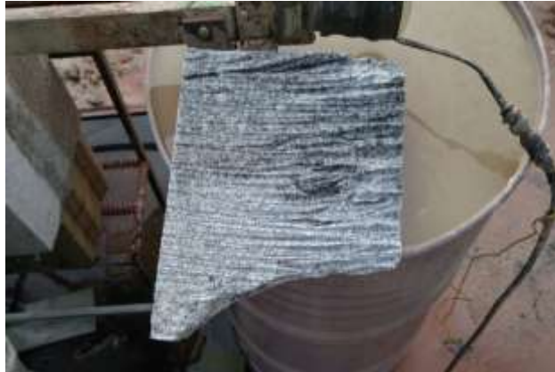
Fig. 7. Cross-section view of a granite specimen (using ASJ system)