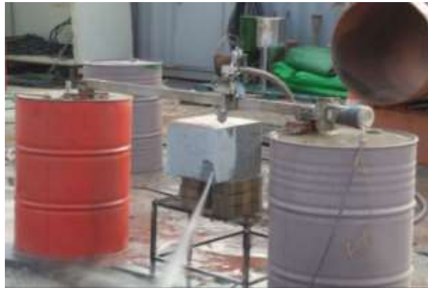
(a) Cutting manipulation system

The AMU receives the high-pressurized water from the waterjet pump and receives the abrasives from the abrasive hopper. The high-pressurized water and abrasives are mixed inside the AMU chamber (storage capacity of 80 kg of abrasives in a 40 L AMU chamber). This AMU product, which was supplied by ANT, mixes water and abrasives under the operating pressure in a weight-proportion of 90% water and 10% abrasive.