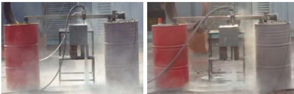
Fig. 5. Penetration performance (left: AWJ system, right: ASJ system)

Penetration performance results of the AWJ and ASJ system are shown in Fig. 5. Fig. 6 reveals that the ASJ system has an overwhelmingly better cutting performance than the AWJ system on penetration tests. The penetration ability of the AWJ system is about 6.3% of the penetration ability of the ASJ system. This phenomenon is also estimated to occur by the air proportion difference of each abrasive waterjet system. The jet stream concentration will decrease when the air proportion is increasing. That is, the degree of jet stream concentration will be much higher in the ASJ system and this high jet stream concentration dramatically improves the penetration rate of the rock cutting. Therefore, for improving the cutting performance in penetration testing conditions, concentrating the jet stream is necessary for rock cutting.