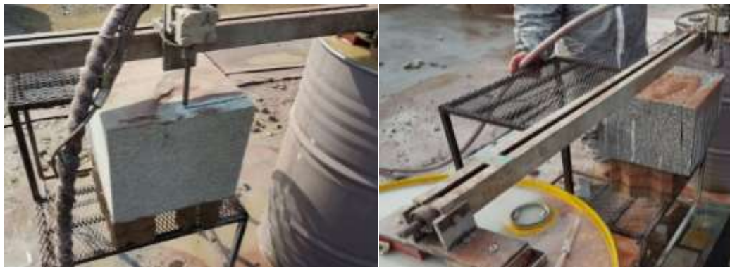
Fig. 3. Overall cutting performance (left: AWJ system, right: ASJ system)

The cutting performance results of the AWJ and ASJ systems are shown in Fig. 3. Fig. 4 demonstrates that the AWJ system has better cutting performance than the ASJ system on traverse cutting, while the cutting ability of the ASJ system has about 60% of the cutting ability of the AWJ system (cutting depth basis). This phenomenon is estimated to occur by the air proportion difference of each abrasive waterjet system. Mostly the AWJ system contains a higher proportion of air than the ASJ system, and the jet stream (high-pressurized water and abrasive) is more distributed by air on comparatively large areas. Therefore, improving the cutting performance in traverse cutting conditions by distributing the jet stream is needed for rock cutting.