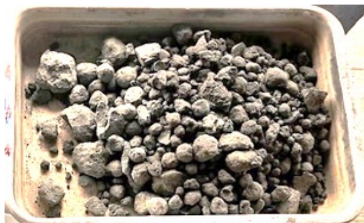
(a) Cement clinker before grinding

size distribution. Fig. 1 illustrates the appearance of the clinker before and after grinding to achieve the desired fineness.