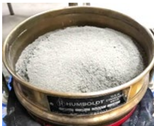
(b) Gypsum after grinding