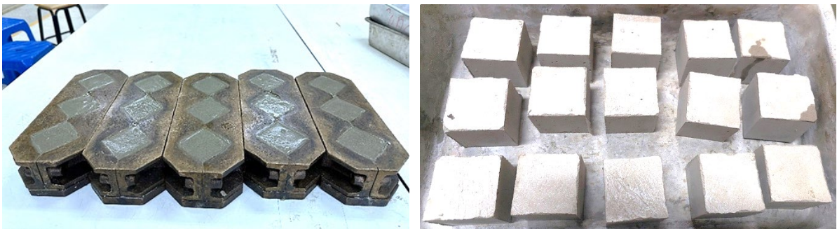
Fig. 3 Mortar casting and samples after demolding.

Fig. 3 illustrates the casting process and the casting of mortar. The casting procedure involves utilizing molds with dimensions of 50 x 50 x 50 mm. After casting, the specimens are placed in a temperature-controlled environment set at 23 \pm 2 degrees Celsius for a duration of 24 hours. Subsequently, the molds are removed, and the specimens are subjected to curing in water until the testing time.