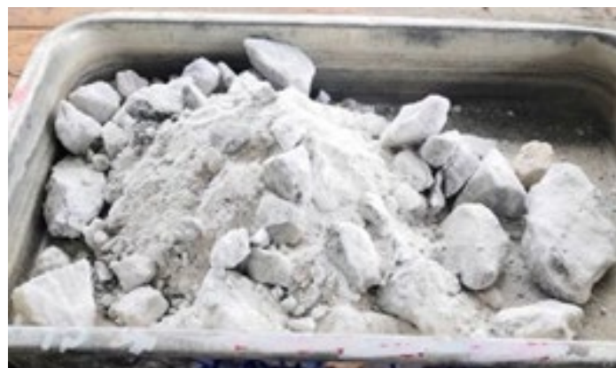
(a) Gypsum before grinding

Gypsum is a key ingredient in cement production, where it is added as a retarder to delay the setting of the cement and to facilitate the bonding of cement with other construction materials. The preparation process of gypsum involves grinding using a Los Angeles Abrasion Machine, similar to the preparation of cement powder. Subsequently, it is sieved to obtain the desired particle size. Fig. 2 illustrates the appearance of gypsum before and after grinding to achieve the desired fineness. In this study, the amount of gypsum added was controlled at 5% by weight of the cement.