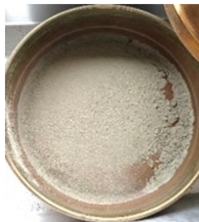
(b) Cement powder after grinding